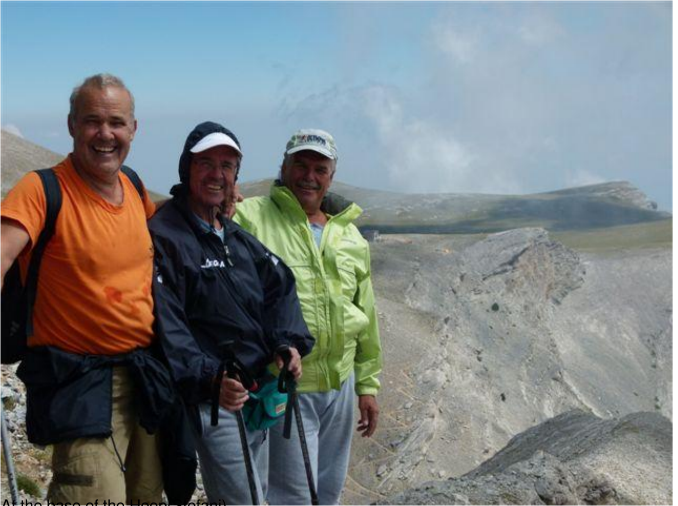
At the base of the Hoop(Stefani)