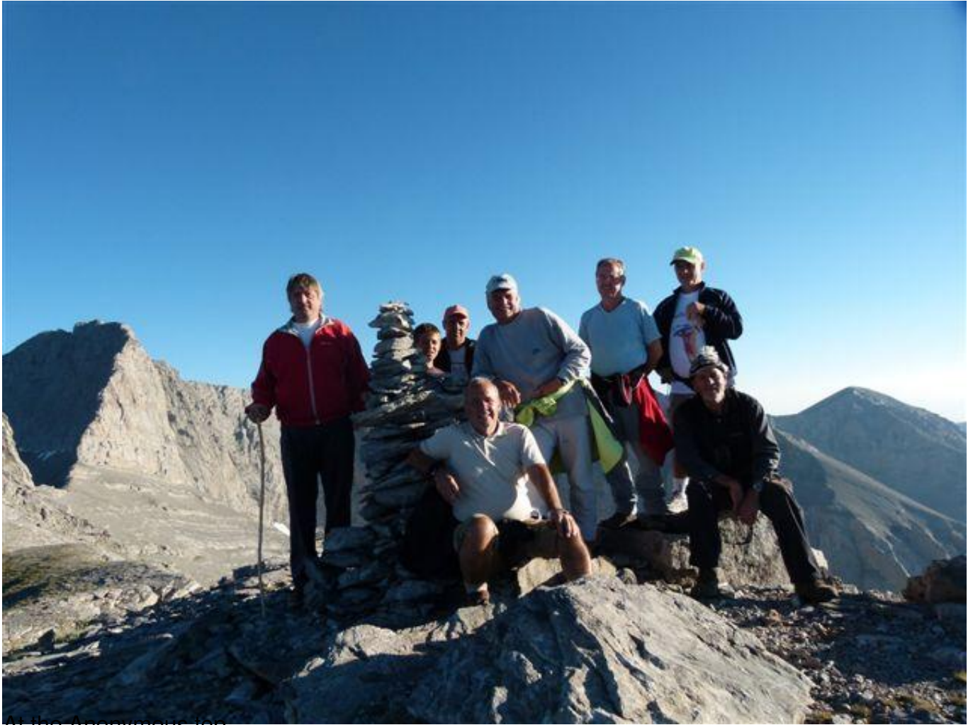
At the Anonymous top