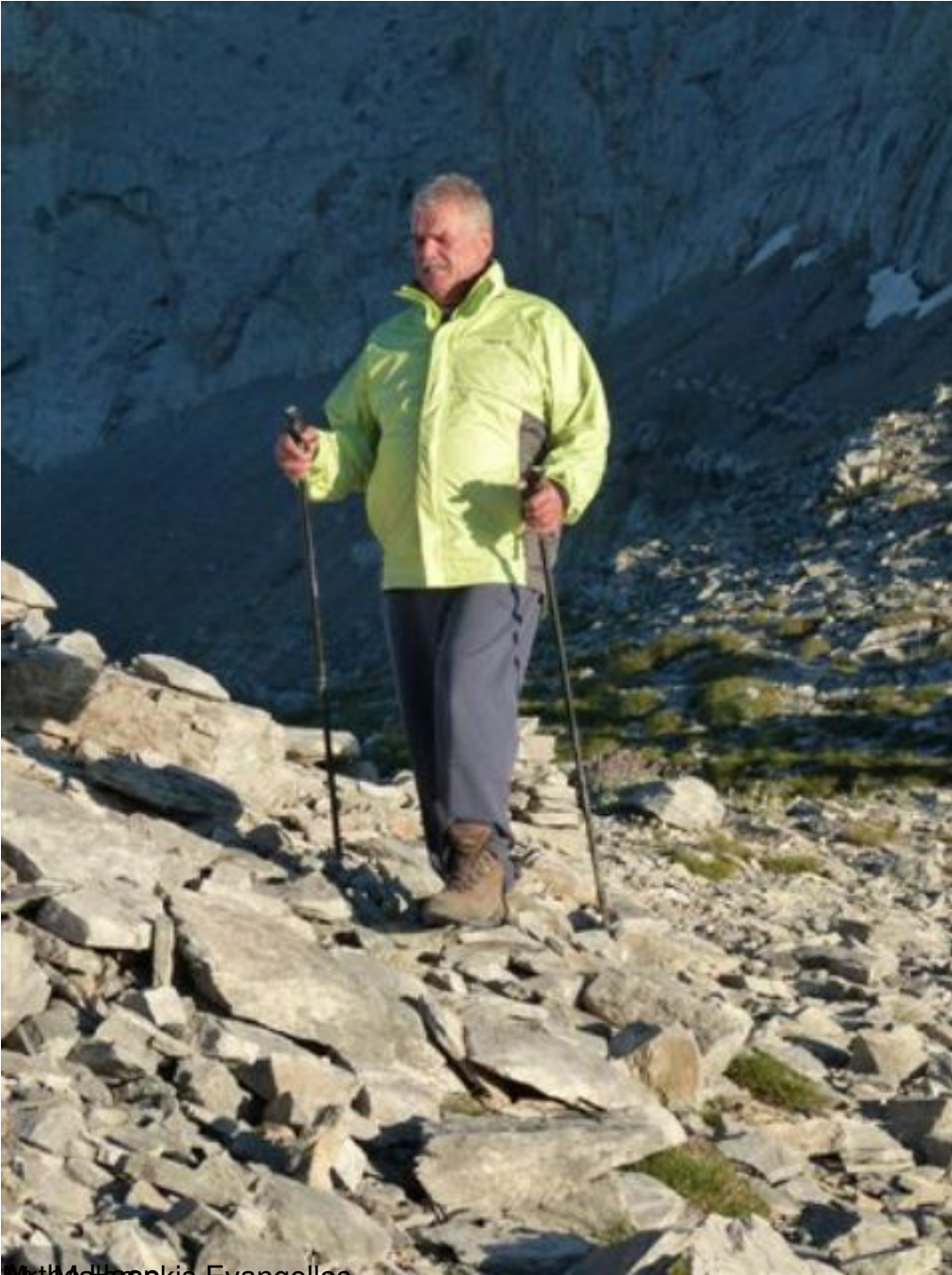
Art by Evangelos Evangellos