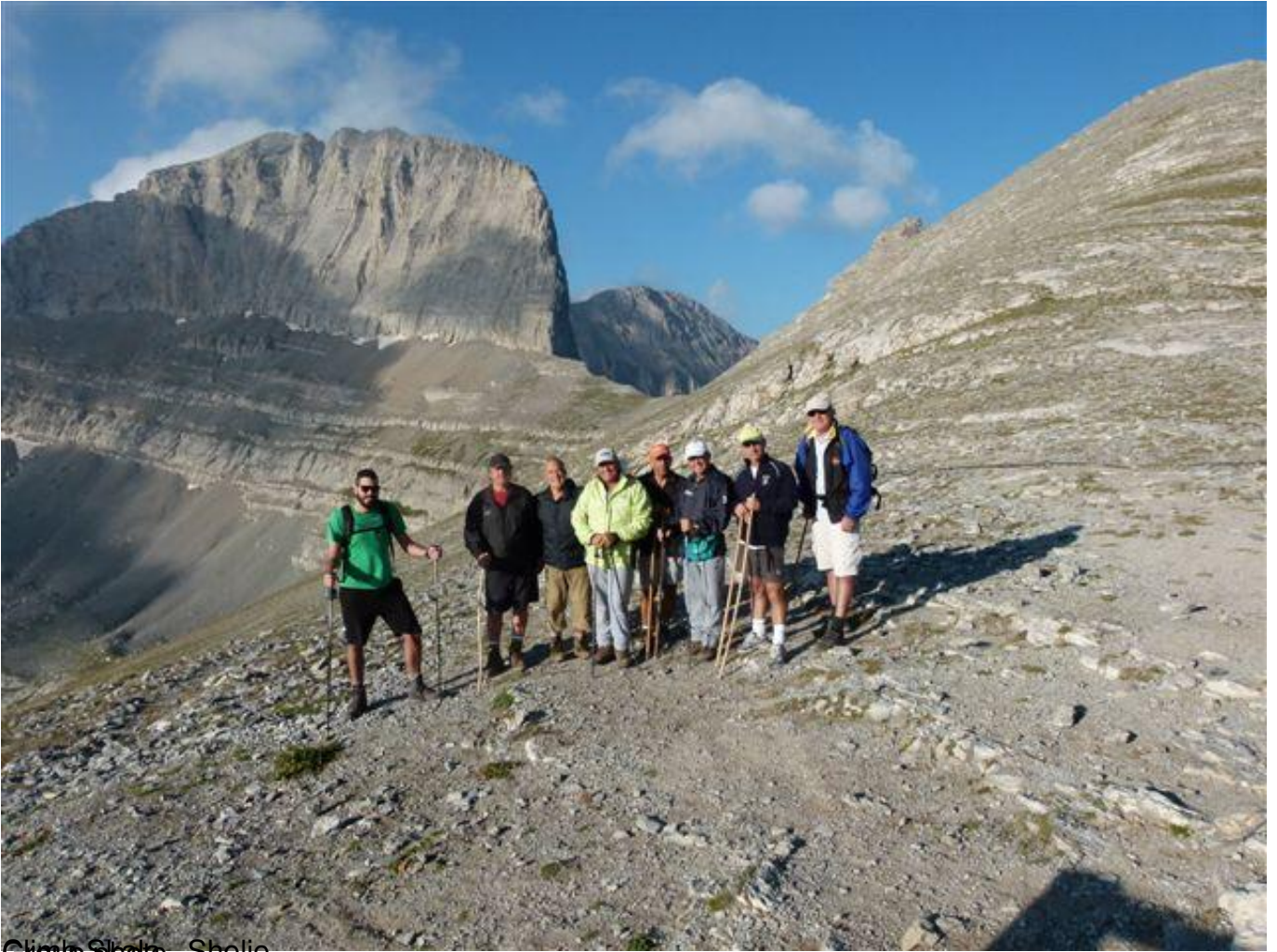
Group Skala - Sholio