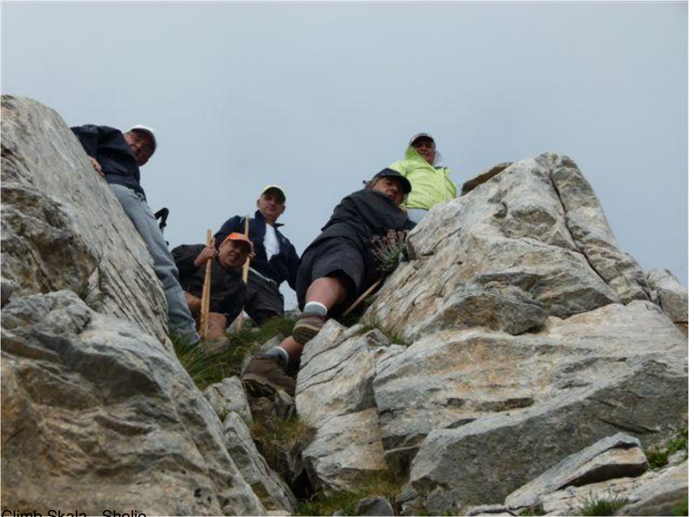
Climb Skala - Sholio