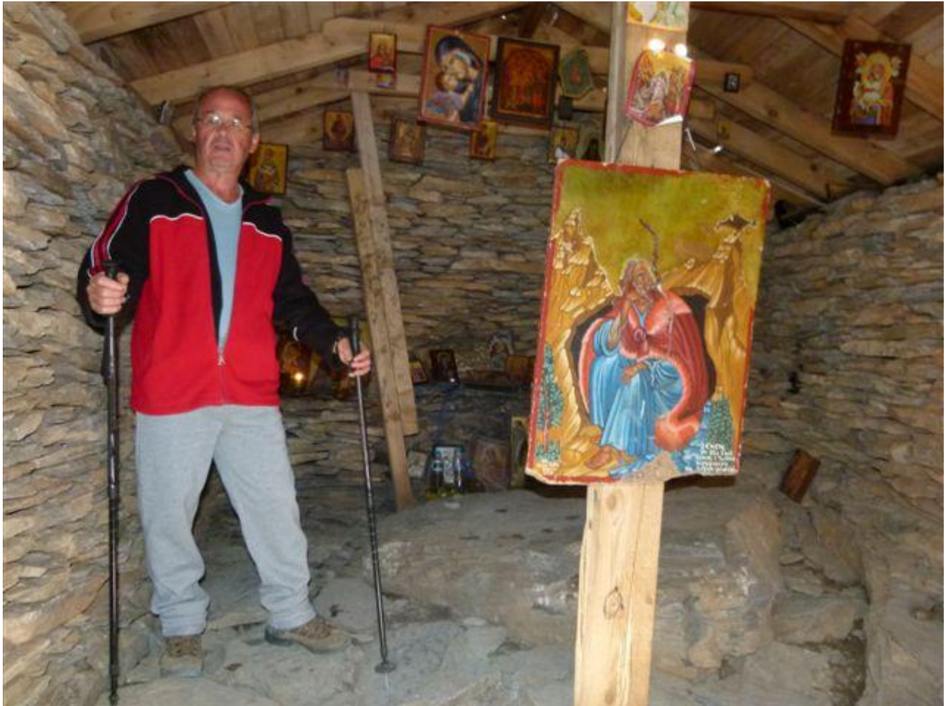
At the Prophet Ilias